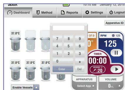
Dashboard screen with Volume Set