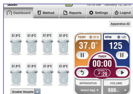
Dashboard screen with wireless in-shaft temperature sensors